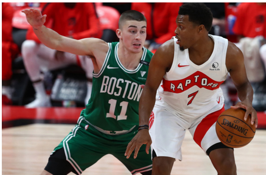
Payton Pritchard is turning heads in his rookie year.

It's not all about the stats either because his plus-minus that game was 18+ which is pretty good. In that same game, he played loads of minutes even though