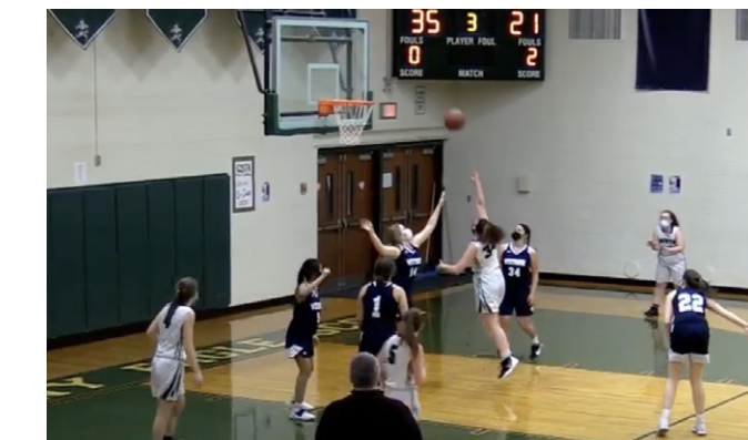
The girls varsity started its season with a win on Feb. 11.