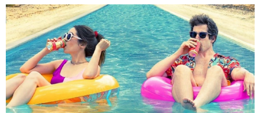
A scene from Palm Springs. Hulu Original