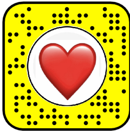
Snapchat has become even more popular as a way to connect.

However, some students also feel as though their dating life has been the same, and a few believe it is actually easier for them to meet new people on