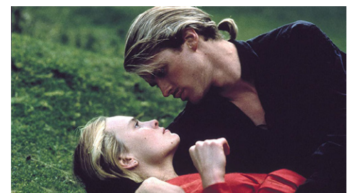
A scene from The Princess Bride. 20th Century Fox