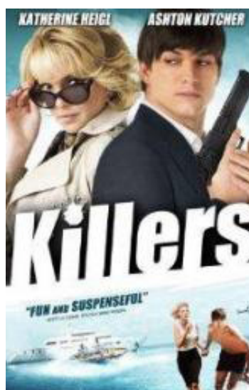
Above, a poster from Killers.